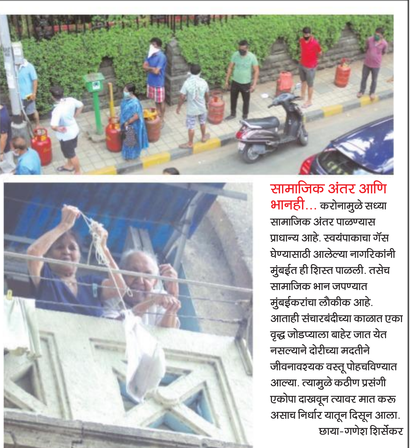
सामाजिक अंतर आणि भानही... कोरोनामुळे सध्या सामाजिक अंतर पाळण्यास प्राधान्य आहे. स्वयंपाकाचा गॅस घेण्यासाठी आलेल्या नागरिकांनी मुंबईत ही शिस्त पाळली. तसेच सामाजिक भान जपण्यात मुंबईकरांचा लौकीक आहे. आताही संचारबंदीच्या काळात एका वृद्ध जोडप्याला बाहेर जात येत नसल्याने दोरीच्या मदतीने जीवनावश्यक वस्तू पोहचविण्यात आल्या. त्यामुळे कठीण प्रसंगी एकोपा दाखवून त्यावर मात करू असाच निर्धार यातून दिसून आला.